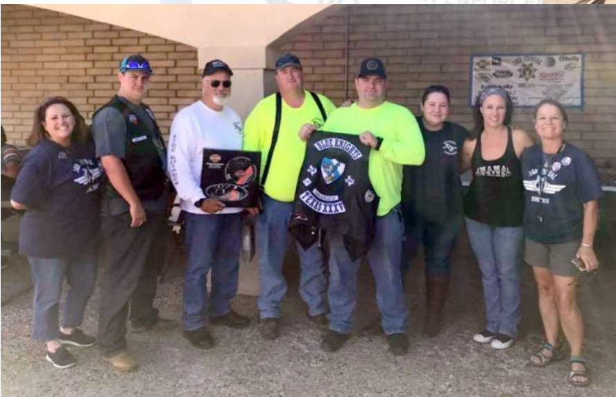
Boss Memorial Run