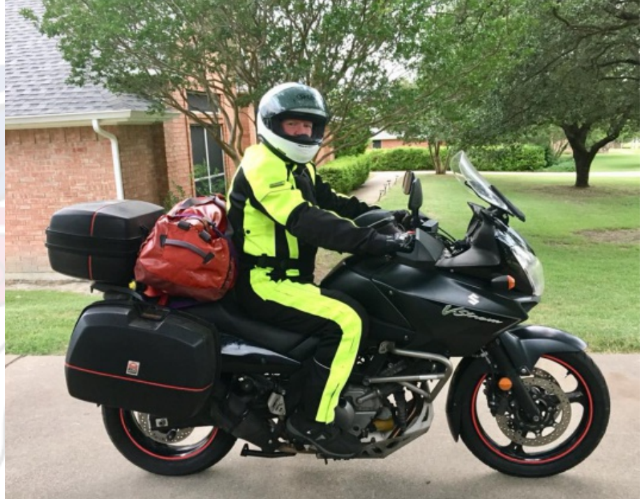
"Stargeezer" loaded up and heading toward Canada.