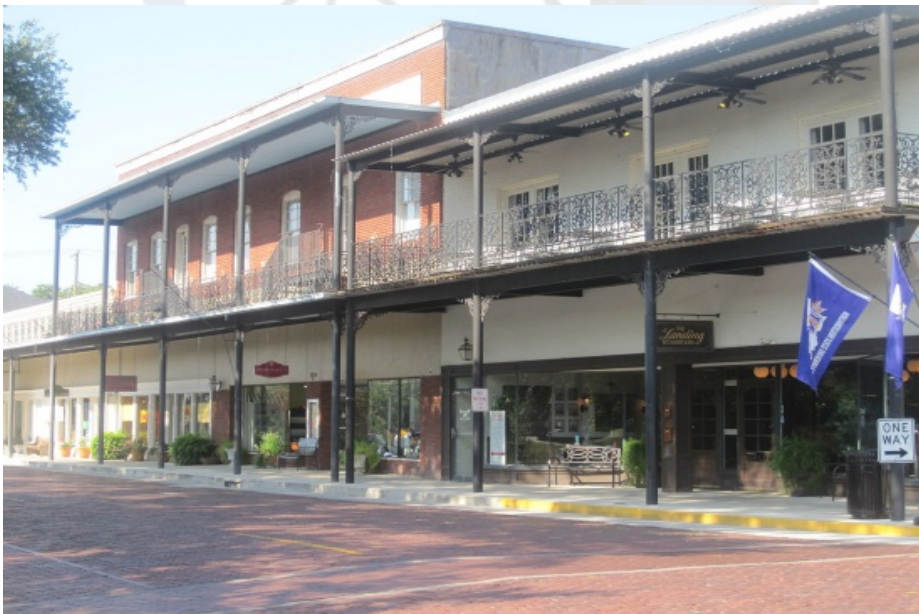
Downtown Natchitoches with historic buildings, stores, and shops.

[By Billy Hathorn - Own work, CC BY-SA 3.0, https://commons.wikimedia.org/w/index.php?curid=7580587 ]