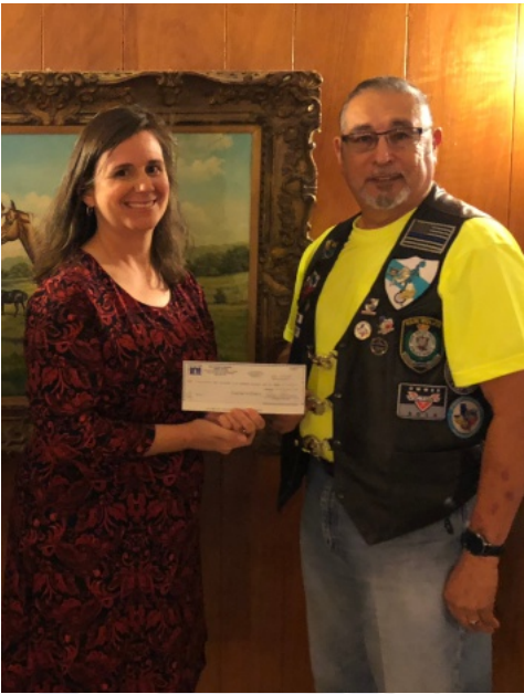
Mosaic of San Angelo

During the month of April, 2018 Blue Knights Texas XXXV sponsored the 5th Annual Jaime Padron Ironbutt Run. Proceeds from the event were distributed between the San Angelo Area Foundation (Padron Scholarship Fund) and the local Mosaic of San Angelo. Each organization was presented a check for $1,500.